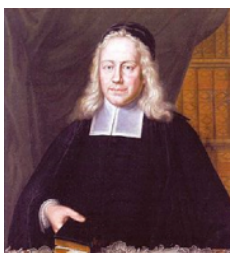
August Hermann Francke

In that connection, I have only to mention the name of George Müller ... and, possibly, that of August Hermann Francke, whose own experiences some 130 years previously 16 provided Mr Müller with much of the inspiration for his work with orphans.