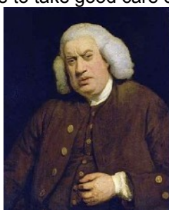
Dr Samuel Johnson (1709-1784)

I have read that Samuel Johnson (known best perhaps for his English dictionary) 'was once challenged about the amount of care he was taking over his stomach. Dr Johnson replied (making much the same point as the Bible commentator), "My dear sir, if I did not take good care of this place, I would not be able to take good care of anything else". 7